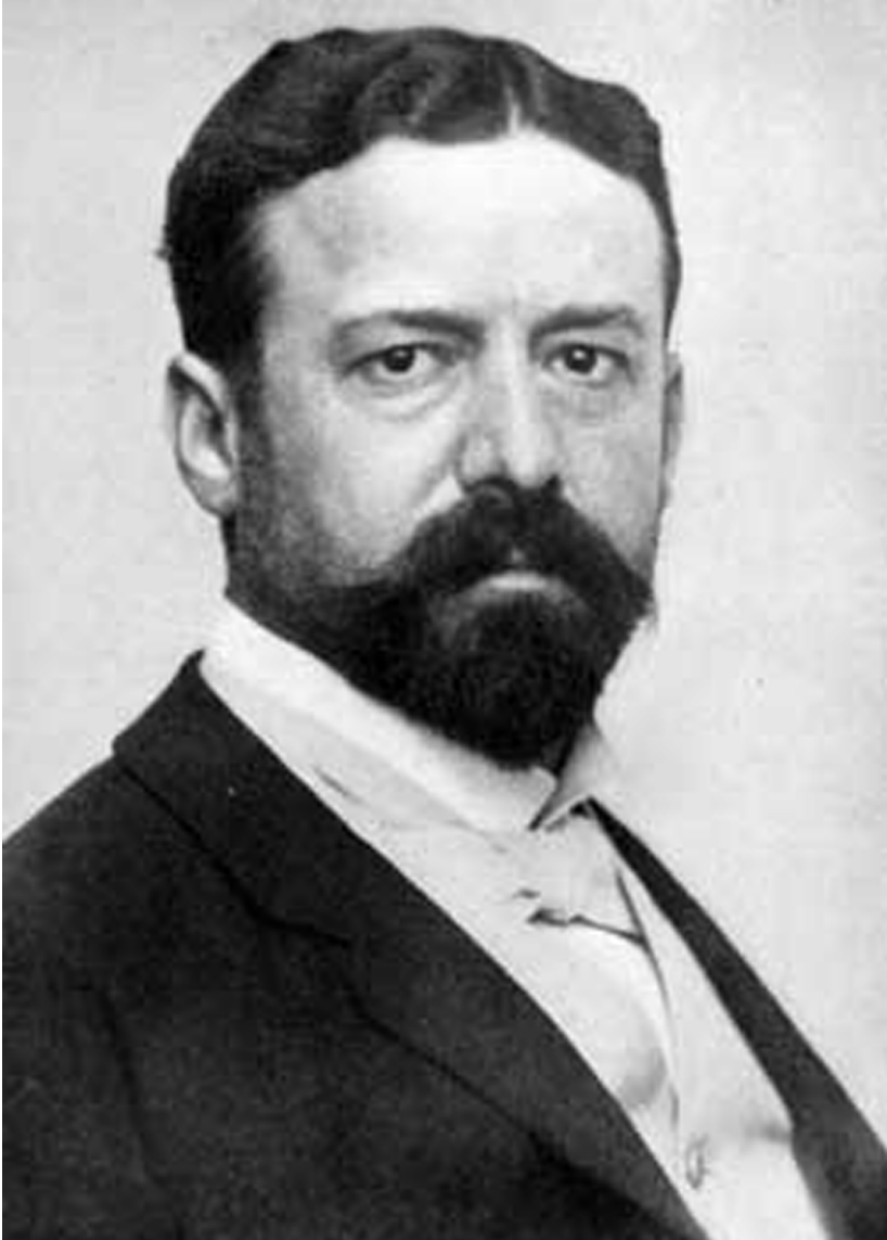
Figure 3. James Creelman was a widely traveled, cigar-chomping correspondent who had a keen taste for hyperbole and a fondness for overstatement. He often took a starring role in his own dispatches.